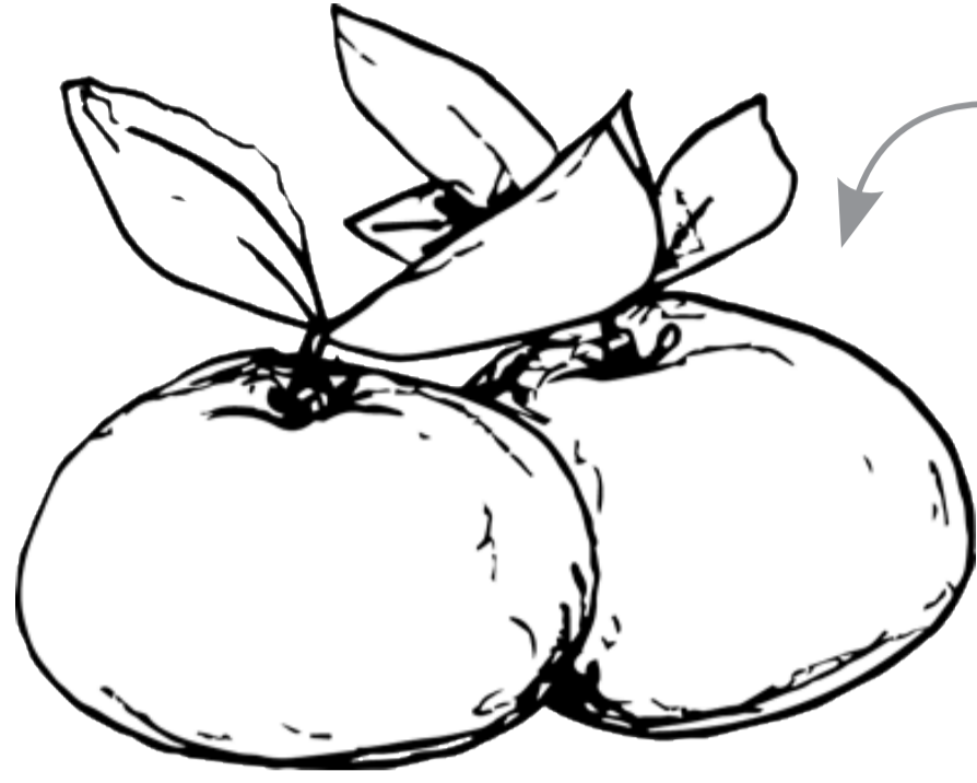
Keiappel ( Dovyalis caffra )

This popular garden plant is indigenous to the summer rainfall area of southern Africa. It is an attractive, tall shrub that is drought tolerant. The shrubs produce ample fruit in summer which are roughly the size of a small plum and taste like an apple with the texture of a peach. The fruit has been eaten by indigenous people in the region for centuries. The fruits can be used to make jams, cordials or refreshing sodas. Find these plants on the Food from the Ancestors trail.