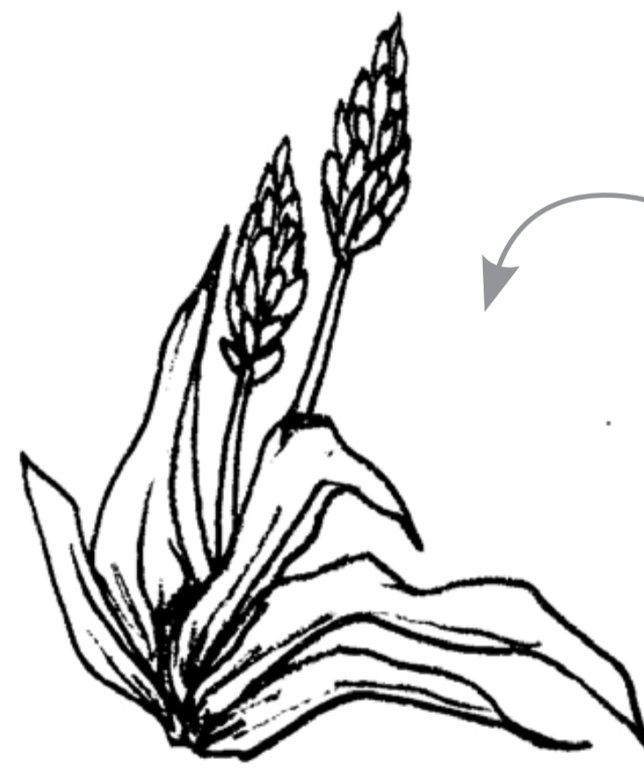
Veldkool ( Trachyandra falcata )

Veldkool is a geophytic plant that produces a large flower spike (inflorescence) which is edible and resembles an asparagus. The spears have an amazing flavour and texture similar to asparagus. Veldkool is an important component of a traditional dish, Veldkoolbredie, which is a stew of several indigenous vegetables and lambs' meat. Find this plant growing in winter on the Food from the Ancestors trail.