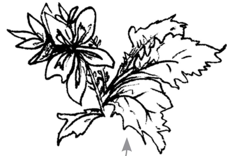
Rose Geranium ( Pelargonium graveolens )

This hardy succulent forms thick carpets of growth even on sand dunes. Every part of the plant is edible and tart (as the name suggests). The fruits (or fig) are one of the most celebrated traditional foods in South Africa today. The fruits are sustainably wild harvested and sold commercially. Hunter-gatherers used the plant medicinally for its strong anti-inflammatory and anti-microbial activity. Find sour fig and their cousin, the Elands fig growing on the Food from the Ancestors trail.