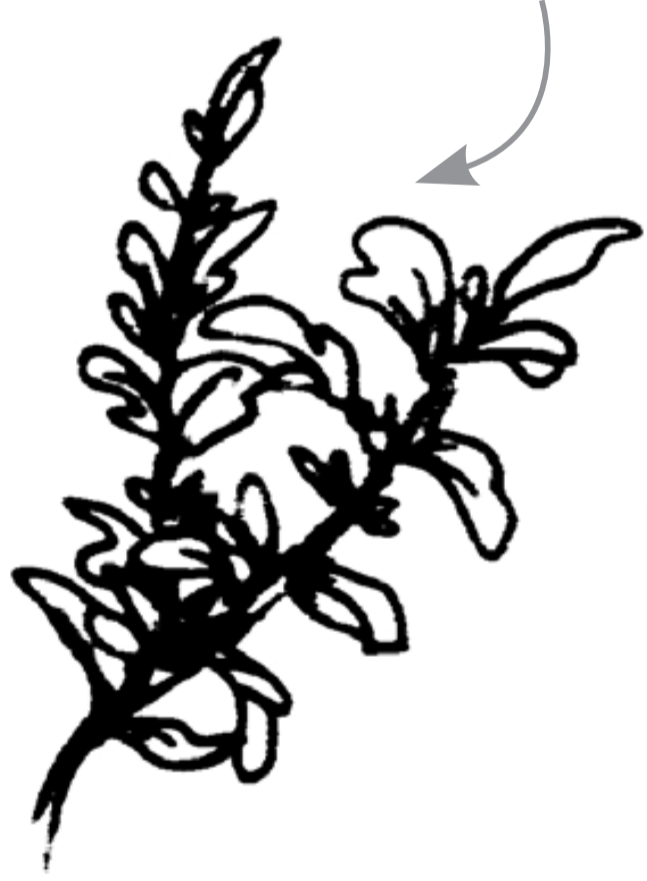
Slangbessie ( Lycium ferocissimum )

This hardy, thorny shrub grows all over the West Coast and is a sister species to the well known Goji berry. Just like the Goji berry, the small, orange fruits of this species are packed with vitamins and antioxidants. It has a flavour reminiscent of a tomatoes, mixed with strawberries. These fruits were eaten by hunter-gatherers. Find these shrubs in the food garden and on the Food from the Ancestors trail.